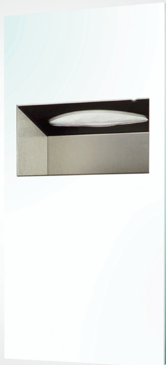
Model shown 09.3000.3